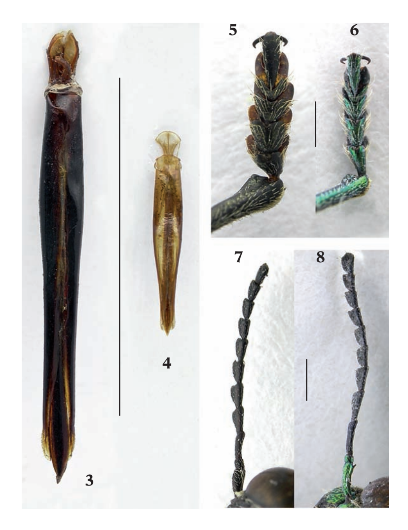
Figg. 3-8 – Aedeagus of Chrysodema danterina n. sp. holotype (3); aedeagus of Chrysodema smaragdula (Olivier, 1790) (4); fore tarsomera of Chrysodema danterina n. sp. holotype \delta (5); fore tarsomera of Chrysodema smaragdula (Olivier, 1790) \delta (6); antenna of Chrysodema danterina n. sp. holotype \delta (7); antenna of Chrysodema smaragdula (Olivier, 1790) \delta (8). Scale bars: figg. 3-4 = 10 mm, figg. 5-8 = 1 mm.

pads and simple claws. Foretarsi short and wide, 3.9 times as long as wide: first tarsomere wider than long, second of the same width but longer, third like the first one, fourth tarsomere narrower. Middle tarsi less short and wide: first and second tarsomeres of the same length, longer than wide, third and fourth shorter. Hind tarsi longer: first seg-